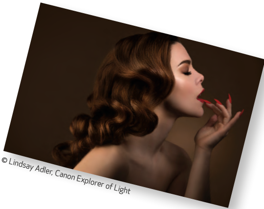
© Lindsay Adler, Canon Explorer of Light