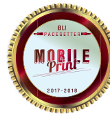
BLI PaceSetter in Mobile Print 2017-2018