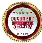
BLI PaceSetter in Document Imaging Security 2017-2018