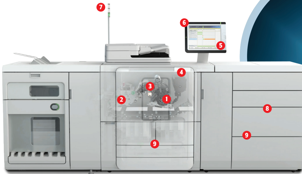
varioPRINT 140 shown with optional accessories.