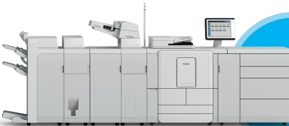
varioPRINT 140 shown with optional accessories.

Designed for in-plants and small to mid-size commercial print shops, the varioPRINT 140 Series provides the dependability and efficiency needed to allow you to focus on expanding your business.