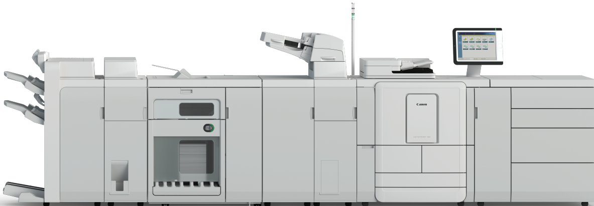
varioPRINT 140 shown with optional accessories.

Converts tray 3 and/or 4 of ePIM to support two stacks of letter-sized media, increasing total letter-sized capacity of the press to up to 12,000 sheets. 8