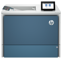
HP Color LaserJet Enterprise X55745dn Printer

This printer is intended to work only with cartridges that have a new or reused HP chip, and it uses dynamic security measures to block cartridges using a non-HP chip. Periodic firmware updates will maintain the effectiveness of these measures and block cartridges that previously worked. A reused HP chip enables the use of reused, remanufactured, and refilled cartridges. More at: http://www.hp.com/learn/ds