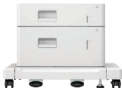
HIGH CAPACITY CASSETTE FEEDING UNIT-D1