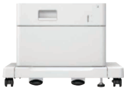
CASSETTE FEEDING UNIT-AR1