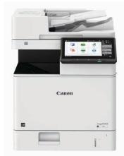
imageFORCE 710F* (Non-Finisher Model)