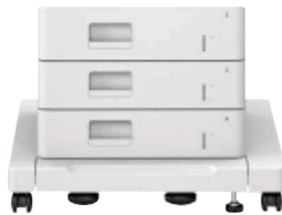
CASSETTE FEEDING UNIT-AX1